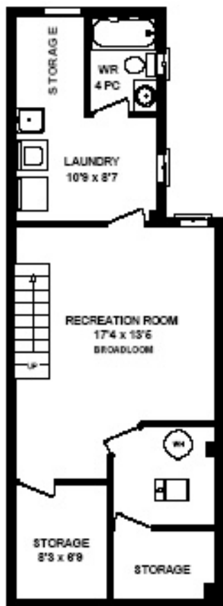
LOWER LEVEL 658 SQ FT

Please Note: Measurements may not be 100% accurate. Floor Plans are provided for convenience and are to be used as a guideline only. FLOORPLAN PLUS 905-471-6028