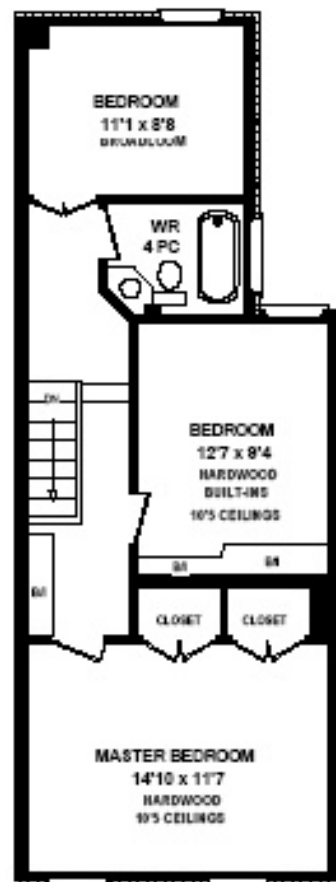
SECOND FLOOR 658 SQ FT