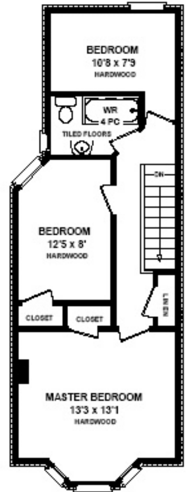
SECOND FLOOR 588 SQ FT

Please Note: Measurements may not be 100% accurate. Floor Plans are provided for convenience and are to be used as a guideline only.