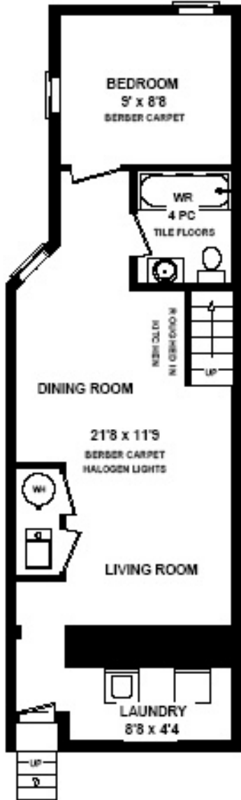
LOWER LEVEL 702 SQ FT